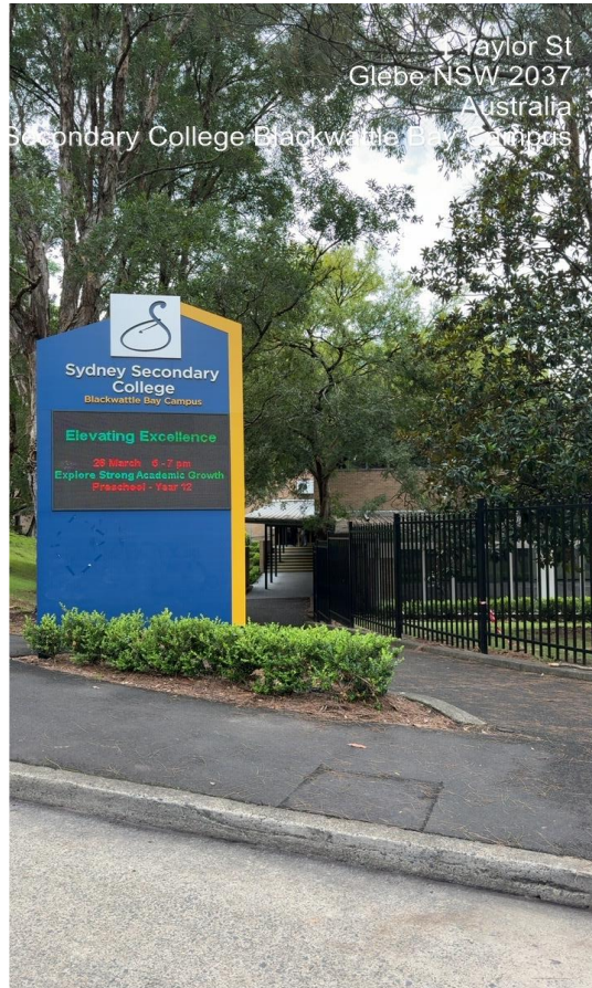
Figure 1: 1 Taylor Street, Glebe viewed from the west